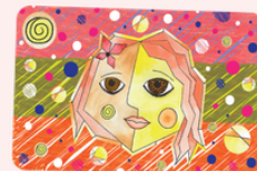
Mouse Mats $16