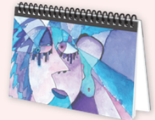
Sketch pads $15

Very last week to order - deadline Friday 29th November! This second delivery of products will be before school breaks up