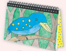
2020 Diaries $18